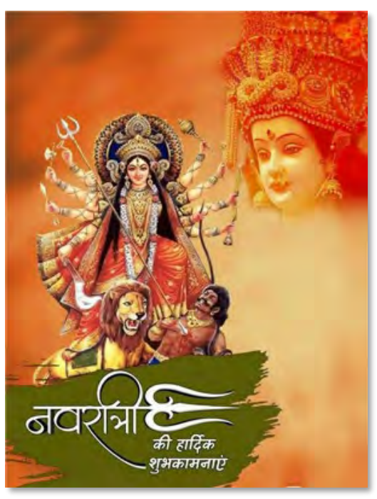
Wish you the blessing of Durga Mother the Goddess of Power.

The Improving Financial Awareness & Financial Literacy Movement in India™ provides a real winning approach to solving a major social problem dealing with the lack of financial awareness along with the financial illiteracy epidemic.